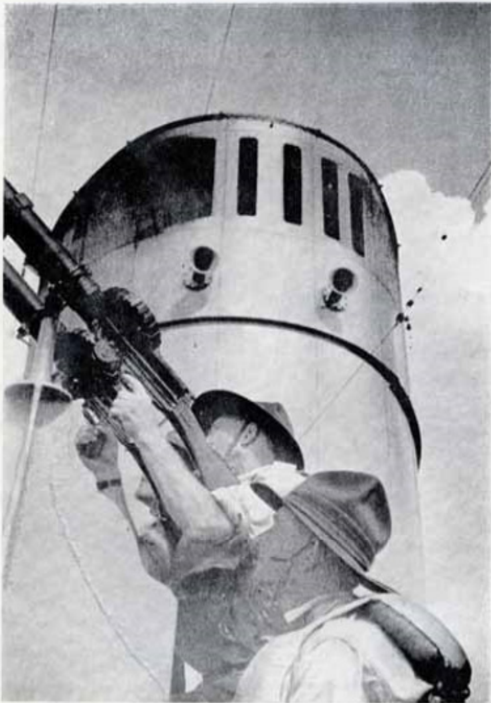
Vigilance Against Air Attack. A. A. Post Silhouetted Against Mighty Funnel of the Transport.