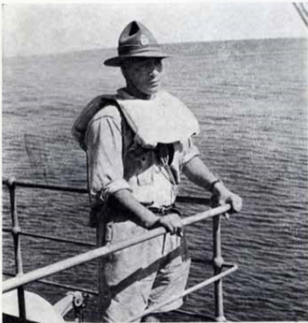
Maori Sentry on Submarine Guard.