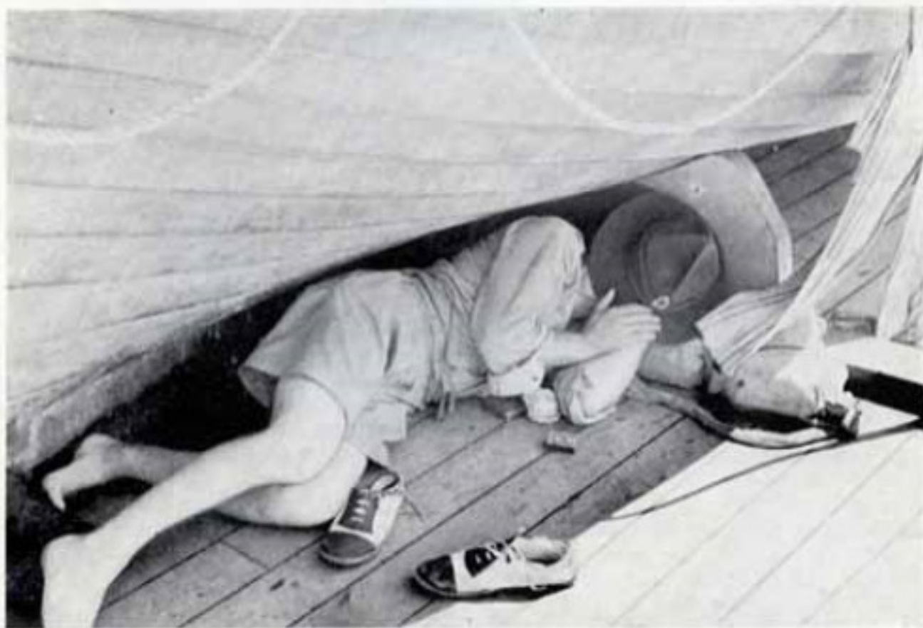
NOONTIDE SIESTA : Sleeping Under the Welcome Shade of One of the Life-boats.