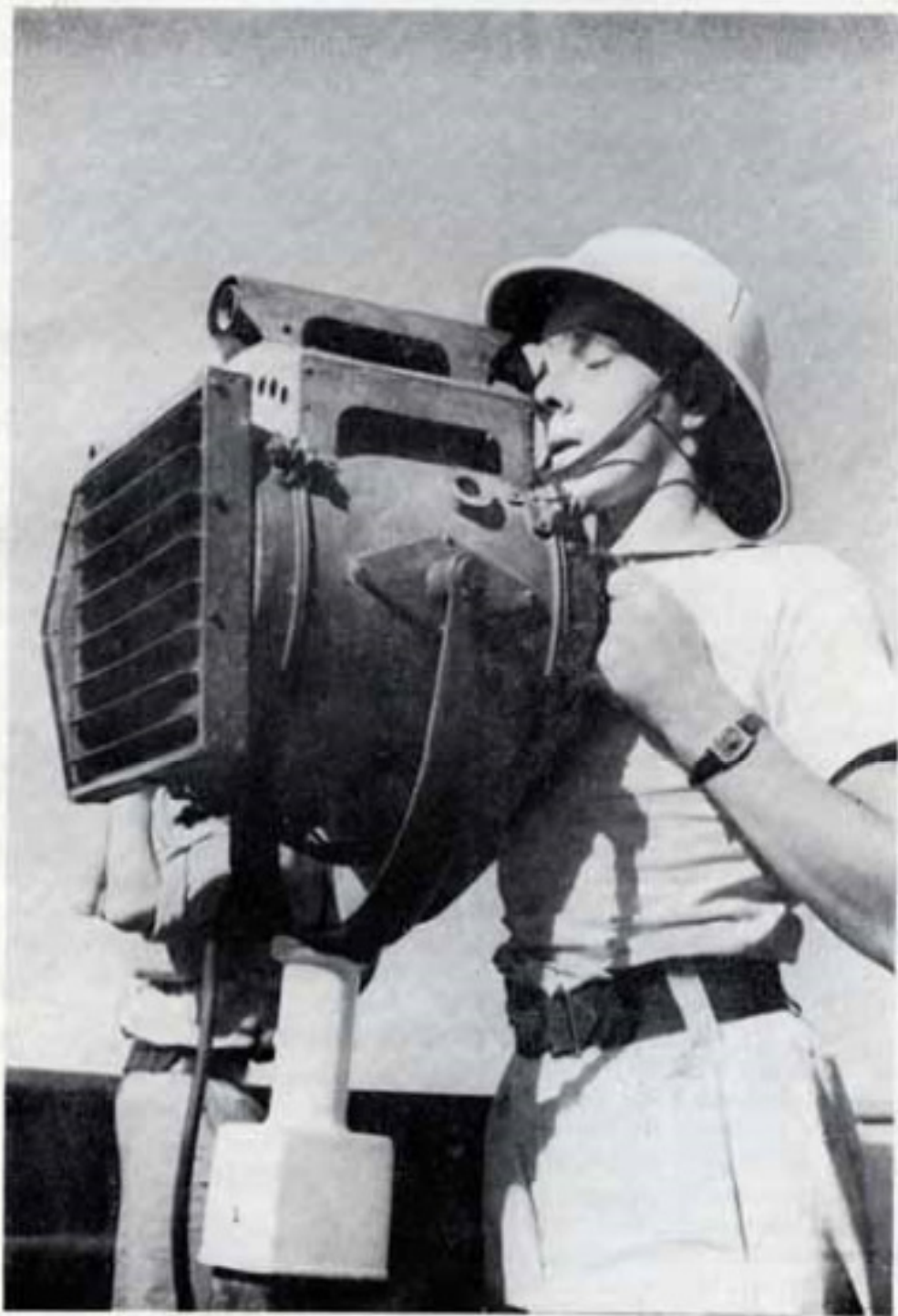
Keeping Contact With the Convoy. Naval Signaller and Lamp.