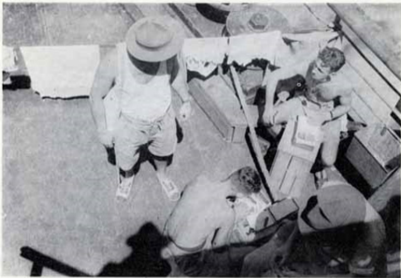
TYPICAL DECK SCENE : Sketcher Works While Companions Hang out Washing.