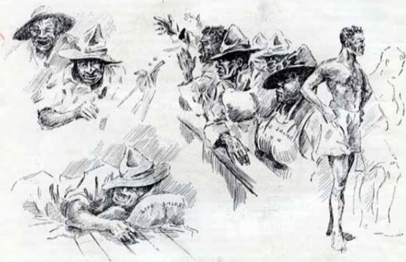
Sailing the Great Sea of Kiwa again—Maoris on Ship

At this point the chronicle of our voyage must end upon a note of suspense. The Odyssey itself is possibly only begun nor do we know to what strange shores we shall penetrate before our task is completed and we return to our homes. By that time we shall have added much to the store of experience we have already accumulated; we shall have known pleasure, pain, hardship and possibly all the anguish of war.