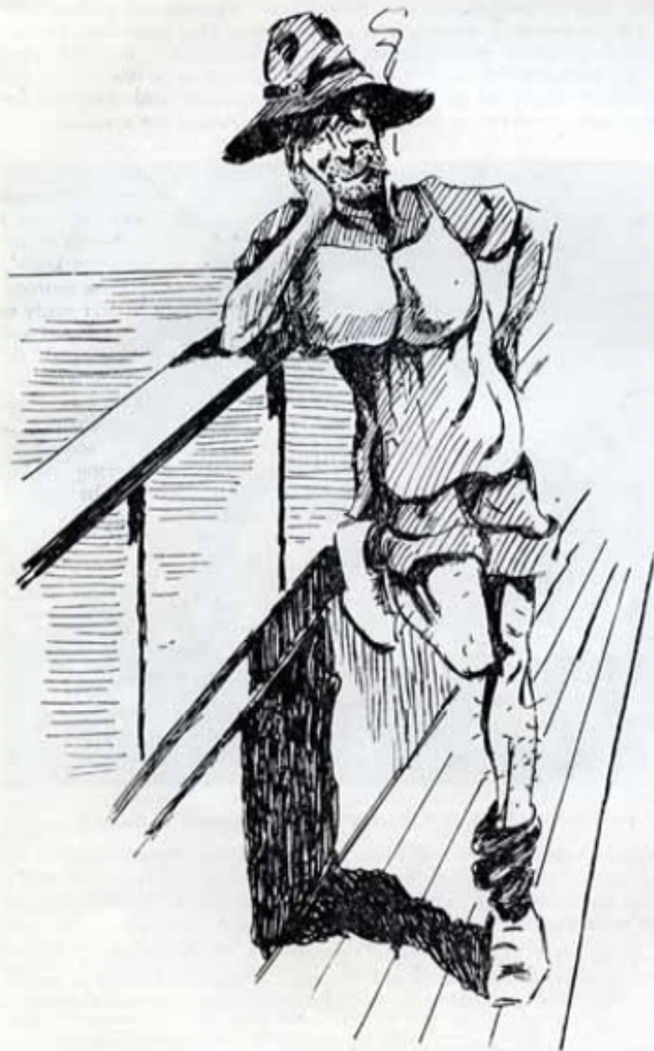
NATURE IN THE RAW Study of an Enau in Repose.