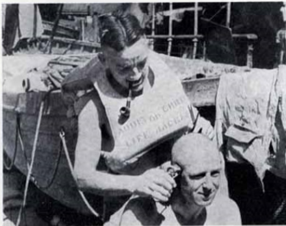
THE COMPLETE HAIR CUT. Buddhist Monk Tonsures followed Edict Against Enaus.